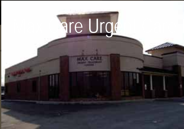
Max Care Urgent Care Facility